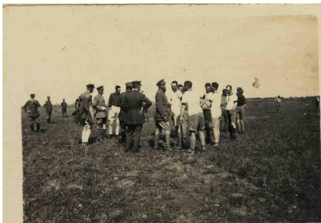
A football match at Gaza.