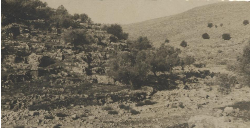
The Wadi Ain Arik

Ain Arik looked very fine in early morn, a fine wadi. Waterered at Ain Arik. 4th T[roop] doing rear flank guard on foot. Rough job. Arrived El Tahta at 1200 via WAdi Arik. Mail in, forage issued – first time since Ludd. Horses and men tired. Plenty of forage and rations.